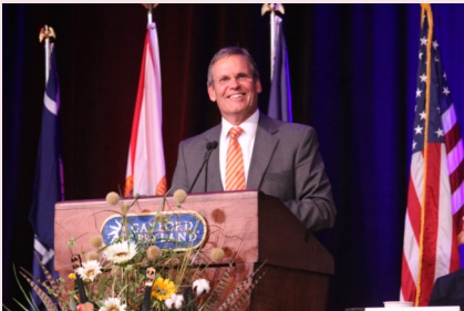
Governor Bill Lee opened the Conference, held in Nashville