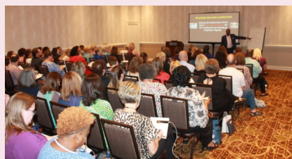
Forty-three different workshops were offered for attendees