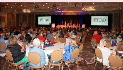
Attendance surpassed all expectations!