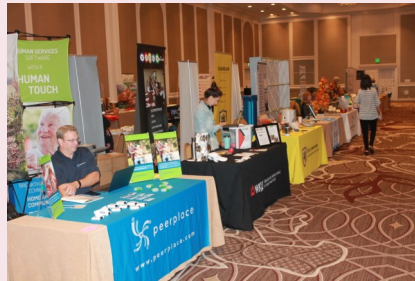
Conference sponsors enjoyed heavy foot traffic from 600+ attendees