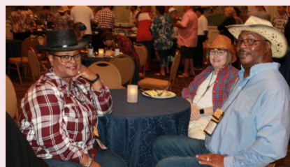
Honky-Tonk Night brought out everyone's inner cowboy